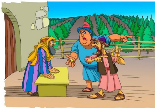
“Why be envious because I am generous?”

ANNOUNCEMENTS – Made by a member of the music ministry. PLEASE WAIT UNTIL THE PRIEST IS SEATED and then begin counting about 30 seconds – ALLOW SILENT TIME. [Please take care to read slowly and distinctly - and be sure you are loud enough to be heard!]