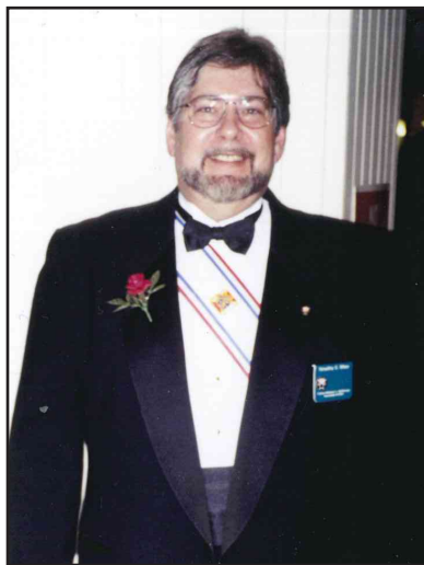
Knights of Columbus Fourth Degree Knight